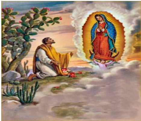
San Juan Diego